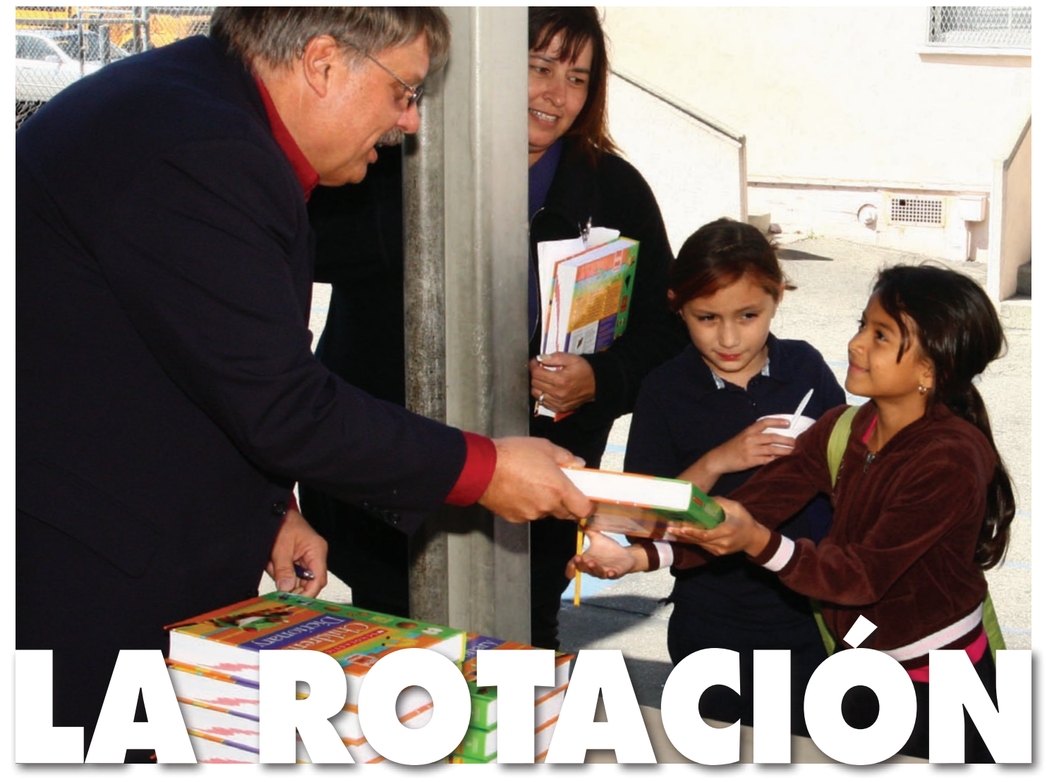
Rotary Club of Palos Verdes Peninsula · April 17, 2009